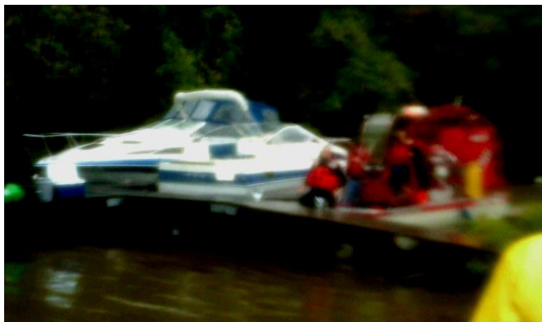
Alplaus FD airboat WR224 pushing a section of dock and two runaway boats to safety.

Also, a problem was where to put them once we had them, since predictions at that time were 3-5 more feet before the river crested. Alplaus teamed up with Niskayuna District #2's airboat to push two of the biggest, still faithfully moored at their slips, out of the current to safety in the old Erie Canal channel behind the Yacht Club. Other rescuers were struggling in their effort to tow most of the remaining strays back against the current all the way to the Marina. A Canal Corp. barge called to assist got as far as the Rexford Bridge and had to turn back because it could not fit under the bridgework. The last of the runaways had been tied off to one of the channel buoys, the airboats ended up going back out for it. Amazingly, all the stray boats were eventually recovered safely, although perhaps a little the worse for wear. Scotia FD's boat did unfortunately sustain some damage in the process. The hot dry summer and rainfall deficit worked in our favor and helped to minimize the flooding.